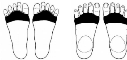
Bottom Right Bottom Left Top Left Top Right Shoulder Reflex location on the feet.