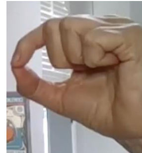
Tip-To-Tip Techniques for holding the shoulder point on the ears.

The feet were demonstrated next, with attention to the outer upper area below the 3 rd , 4 th and 5 th toes on both plantar and dorsal sides. Work was demonstrated from the pad of the plantar side of the foot to the outer edge and then the dorsal area, keeping close to the toes and working with the thumb roll technique and a hold and press, using the tips of the index and middle fingers in the grooves of the dorsal side between the 5 th and 4 th toes, and the 4 th and 3 rd toes. On the grooves, a slow movement was encouraged.